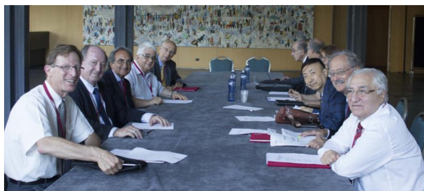
ISCP Board of Directors Meeting in Barcelona

The 20 best posters from the Scientific Meeting will be published in the European Cardiology Review.